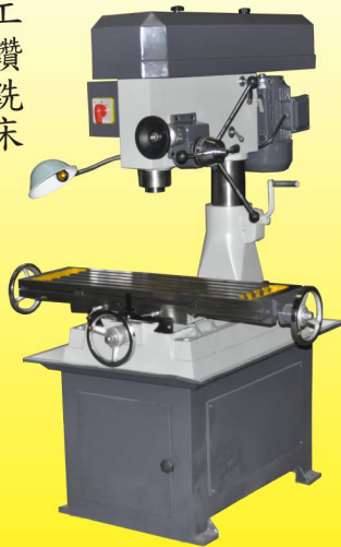
AKS-RM40WS AKS-TOJ40WS DRILLING & MILLING MACHINE (W/ STAND) MADE IN CHINA 中國製造